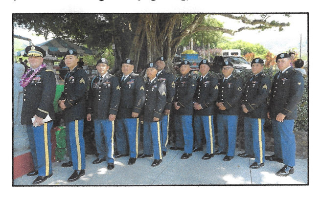
Lt. Col. Matthew Cloud and 100<sup>th</sup> Battalion, 442<sup>nd</sup> Infantry, Regiment of the US Army Reserves