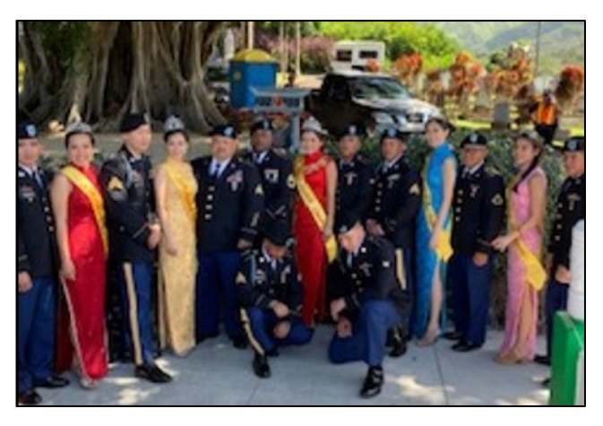
Narcissus Queen and Court with the 100^{th} Battalion, 442^{nd} Infantry Regiment